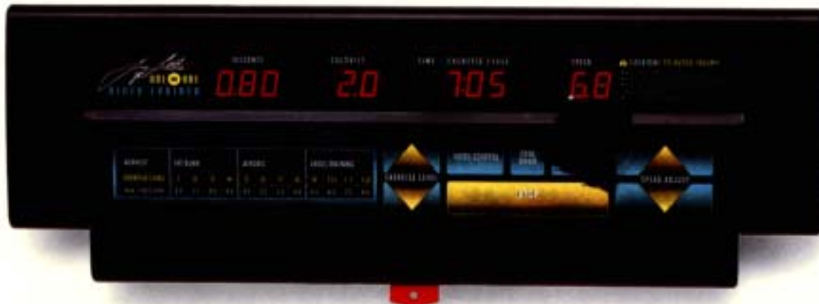
Advanced Interactive Override controls speed automatically. 4-window motivational display shows speed, time, distance and calories burned.

Or better yet, a Personal Trainer? No more boring jogs or losing motivation due to bad weather or lack of motivation ... and no more excuses!