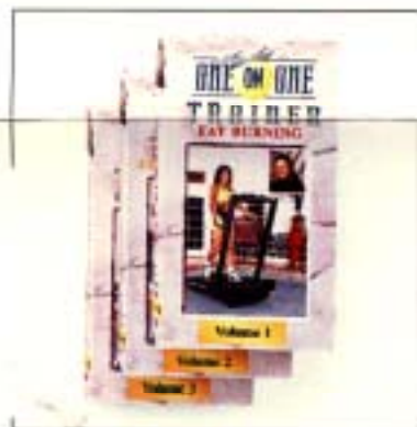
Includes 3 one-on-one videos: Choose from Aerobic Conditioning, Fat Burn or Performance

That's why I'm so excited about my new One-On-One Video Treadmill . I can — using new Video Tracker technology and override controls control your Video Treadmill and give you a good, fat burning cardiovascular workout.