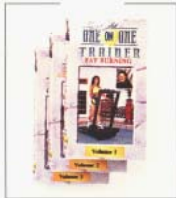
Three Personal Trainer Videos: Fat Burn, Aerobic Conditioning and Crosstraining

I pledge complete satisfaction with my One-On-One Video Trainer Treadmill . Try my Treadmill in your home. Then if within 30 days, you don't look and feel better, I will either replace it or refund the purchase price.